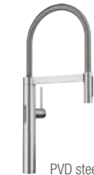
PVD steel 527 462