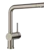
satin platinum 527 698