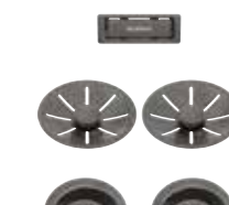
satin dark steel 206 901