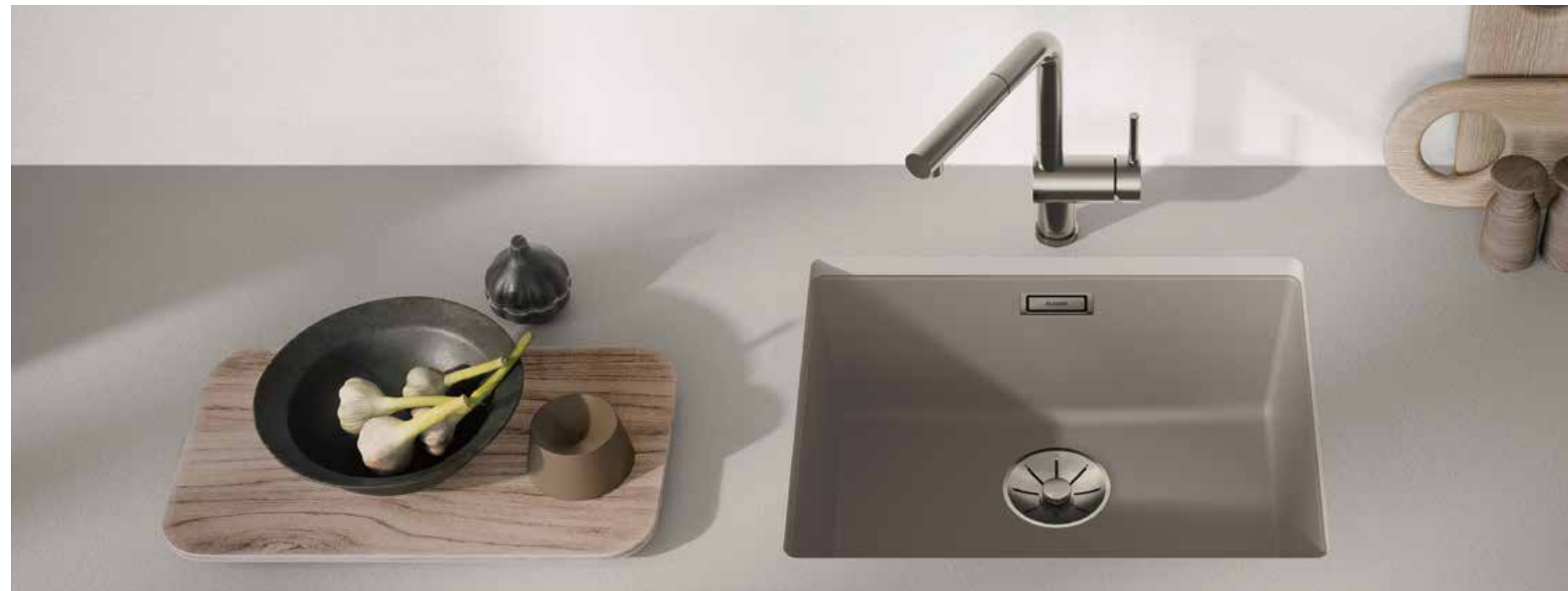
Satin platinum matching tap and Coloured Components