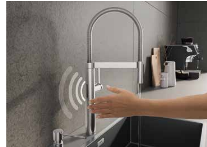
The wave sensor on the tap body activates the sensor function