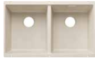
BLANCO SUBLINE 350/350-U