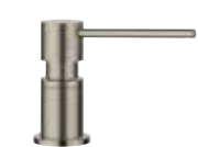
satin platinum 527 721