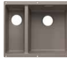
BLANCO SUBLINE 340/160-U Right hand bowl