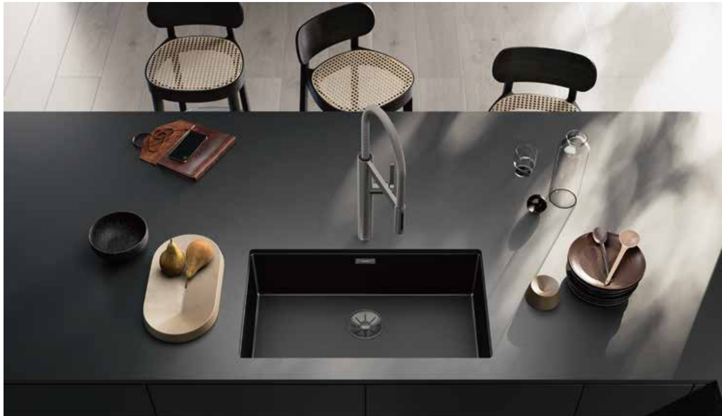
Consistent design with all elements in new dark steel

Here stainless steel shows its trendy side and impresses with its materiality and colour as well as functionality. The new Dark Steel version of the BLANCO design classic BLANCO CLARON provides exclusivity and style.