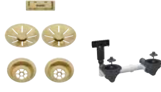
satin gold 207 439