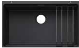
BLANCO ETAGON 700-U