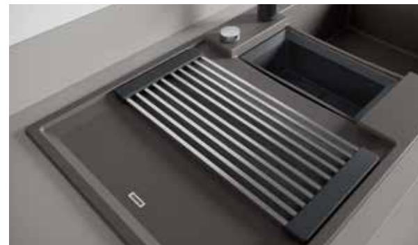
The multifunctional ADIRA folding grid