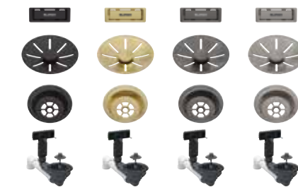
Drain set 1x3½"