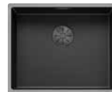
dark steel 527 834