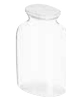
Clear glass 527 671