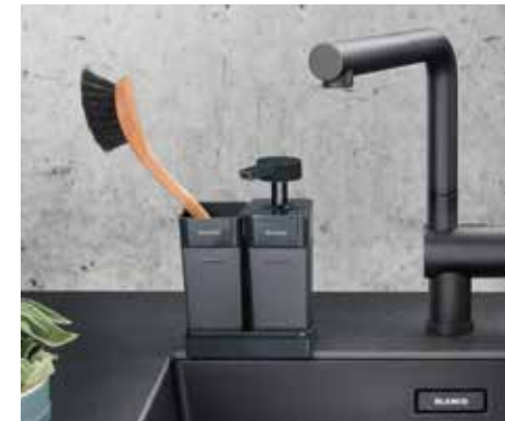
Practical accessories, directly on the sink