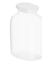
Frosted glass 527 672