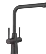
black matt 527 526