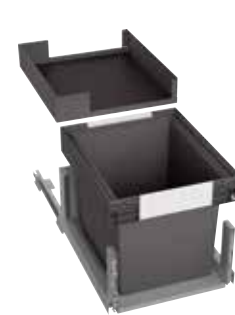
1 x 30 litre capacity 526 304