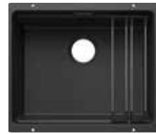
BLANCO ETAGON 500-U