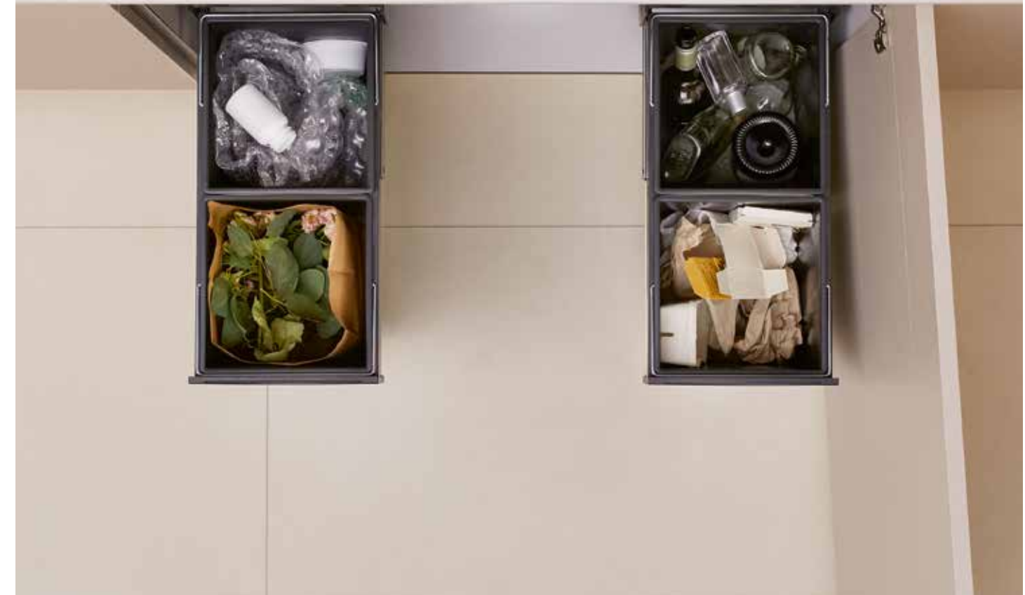
Satin gold matching tap and Coloured Components