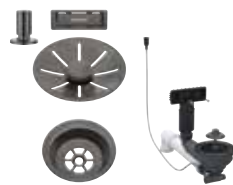
satin dark steel 207 429