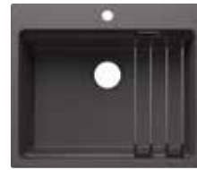
BLANCO ETAGON 6