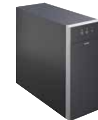
Water conditioning box 527 661