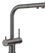
satin dark steel 527 737