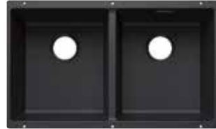
black 527 826