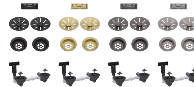
Drain set 2x3½"