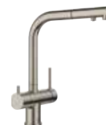
satin platinum 527 715