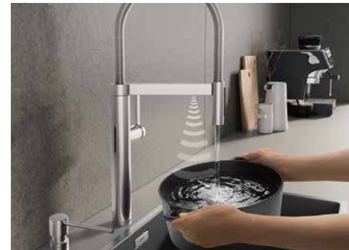
Quick filling, very convenient: the pot-filler sensor makes it possible