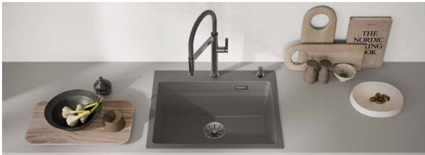
1 ETAGON 6