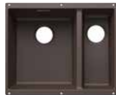
BLANCO SUBLINE 340/160-U Left hand bowl