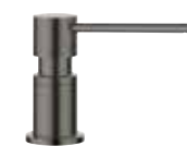
satin dark steel 527 743