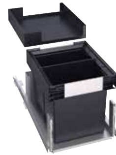
2 x 13 litre capacity 527 854