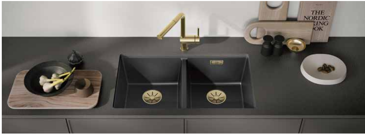
1 BLANCO SUBLINE 350/350-U