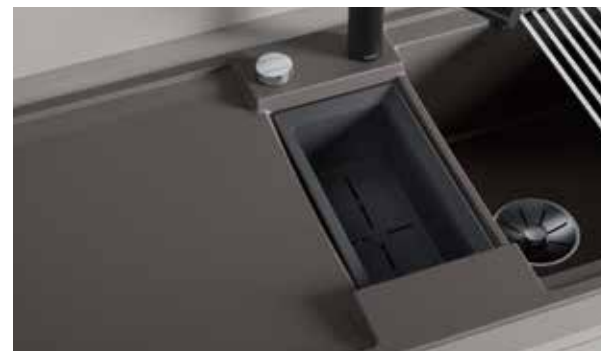
Multifunctional bowl with practical draining function