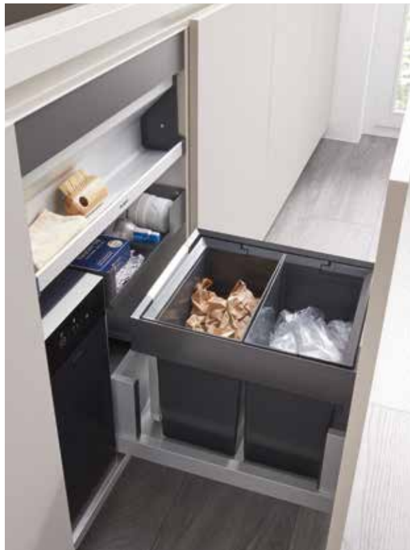
SELECT II 40/2 Combi

With the new waste and organisation products that fit perfectly in the base cupboard with BLANCO drink.systems, there's room for everything and it still looks stylish. Clever accessories make a lot of things around the water place flow better. Impress your consumers with these products to make their kitchen life easier and create further added value for their BLANCO UNIT.