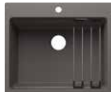
volcano grey 527 747