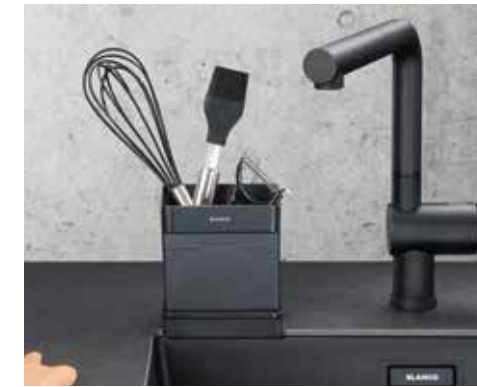
Versatile worktop organisation