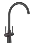
black matt 527 525