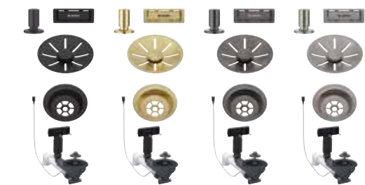
Drain set 1x3½"