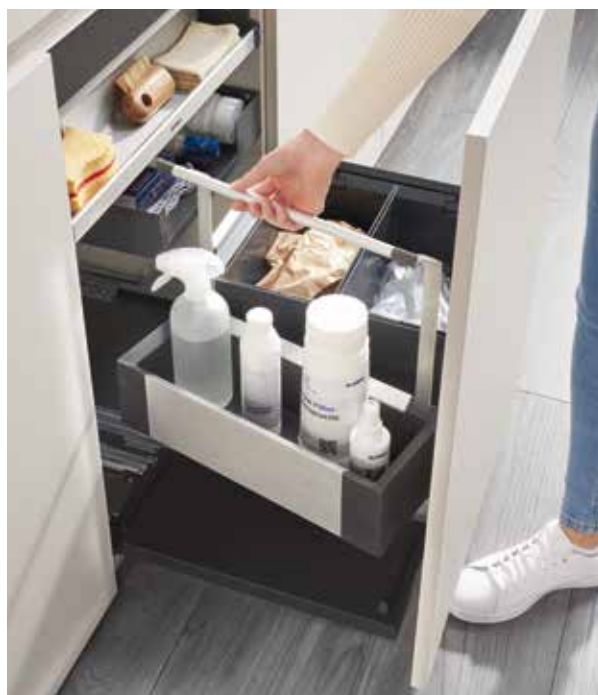
SELECT II 40/2 Combi