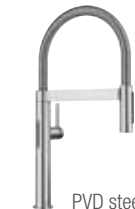
PVD steel 527 466