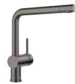
satin dark steel 527 732