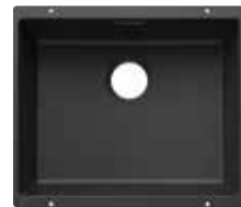
BLANCO SUBLINE 500-U