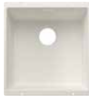
BLANCO SUBLINE 400-U