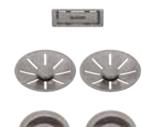
satin platinum 207 410