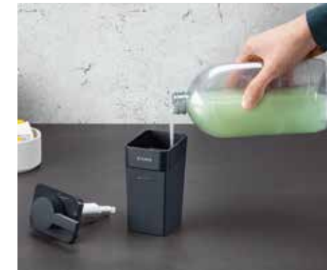
Easy to fill