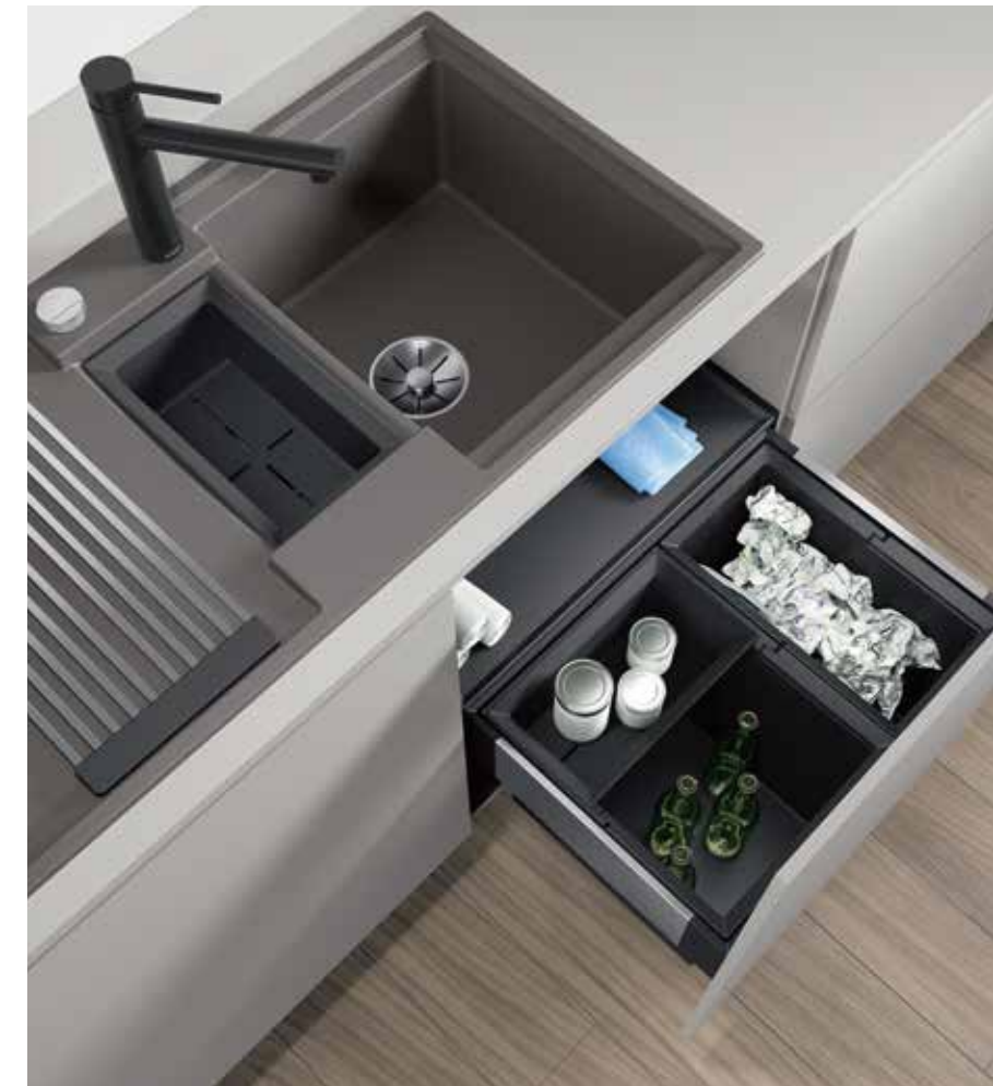
Makes the UNIT work harder: The flexible multifunctional colander works well when placed alongside the waste system