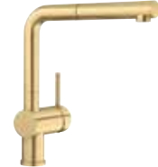
satin gold 526 684