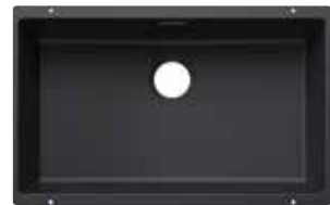
BLANCO SUBLINE 700-U