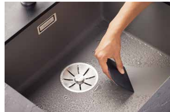
Indispensable: the BLANCO Squeegee